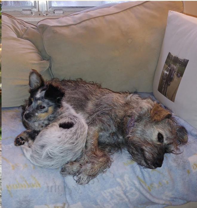
Popcorn and Remy