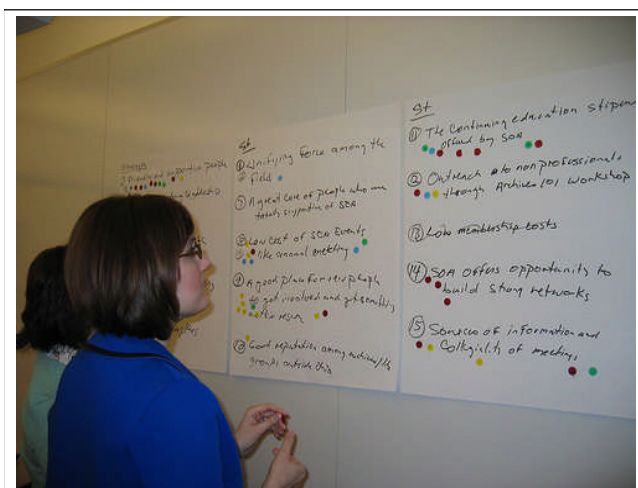
SWOT attendees help SOA set priorities