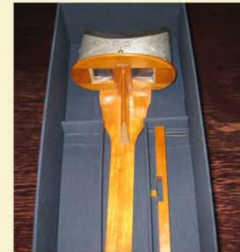
Custom box for viewfinder

Western Memorial Archives is home to many items and objects that do not fall under the traditional category of books, manuscripts, or other paper based ephemera. It can be quite challenging to store these unusually shaped items, especially when space is limited. A solution that we have come up with is to create custom boxes for many of the items. The boxes serve to protect the items from damage and make it easier to store and retrieve the items.