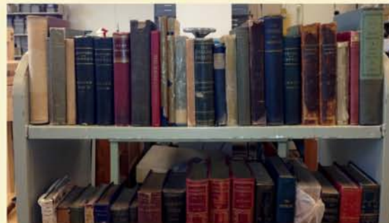
Small collection of Western monographs awaiting treatment