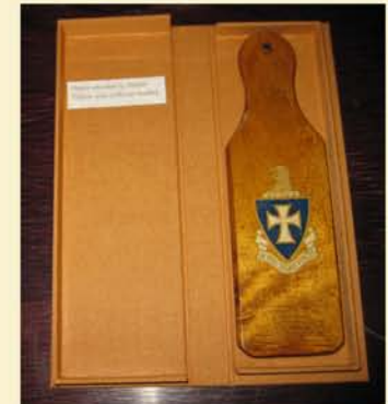
Custom clamshell for Fraternity paddle