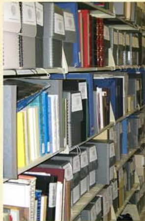
Stacks at Western Archives

As part of an ongoing project between the Western Memorial Archives and the Preservation Department at Miami University, a preservation assessment survey was conducted at the Archives. The results of this survey identified several areas of preservation needs at the Archive: