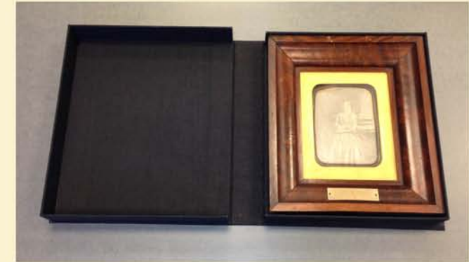
Custom clamshell box for daguerreotype

A Daguerreotype of Helen Peabody, which was on permanent display in the Western Memorial Archives Reading Room, was showing signs of severe fading. In order to preserve this very important photograph, while still being able to display the image, we came up with the solution of using a digital surrogate for display. With this solution in place, visitors to the Archive are still able to enjoy the portrait on display, while the original is safely protected from harmful light in a custom clamshell box. Having a digital copy of the image also gives the Archive more options for use and handling, further protecting the original from damage.