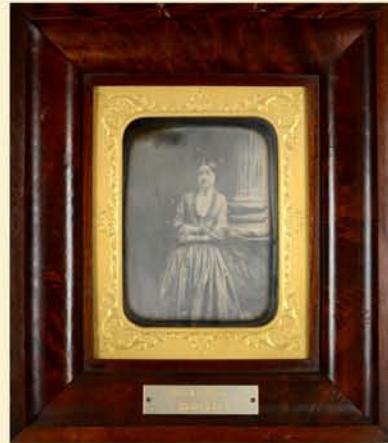
Helen Peabody Daguerreotype

Collaboration between Archives and Preservation is important to maintain the care and storage of documents and artifacts. The goals of collaboration must be to meet challenges head-on and create innovative solutions for the preservation of archive materials. In order for collaboration to be successful, communication between departments must be open and free-flowing. The following are examples of collaborative projects between the Preservation Librarian at Miami University and the Archivist of the Western College Memorial Archives, Miami University.